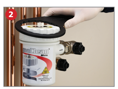
Using the MagnaClean Micro lid spanner, carefully unscrew the lid.